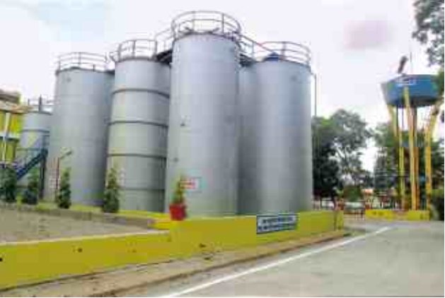
Raw Material Storage Facility