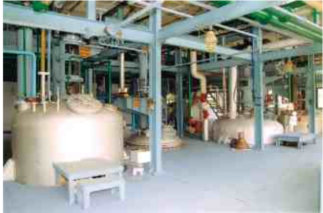
Resin Manufacturing Facility